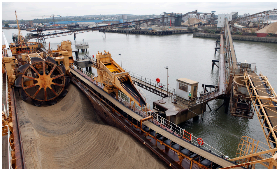
Sand Falcon: dredger unloading its cargo of marine aggregates at Angerstien Wharf on the Thames

specific environmental impact assessment (EIA). Licence renewal is also being supported through voluntary industry-led regional environmental assessment studies to consider cumulative issues.