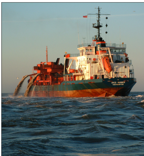
BRITISH MARINE AGGREGATE PRODUCERS ASSOCIATION

Each regional plan will take two to three years to be completed. At the end of October, the first two English marine plan areas were announced by the MMO. Collectively they cover an area of the southern North Sea extending from Flamborough Head in Yorkshire down to Felixstowe in Suffolk. They incorporate a wide range of activities, including significant offshore renewable energy developments, carbon capture and storage and European marine protected sites as well as the Humber and east coast dredging regions, which together account for around 50 per cent of the sector's current production.